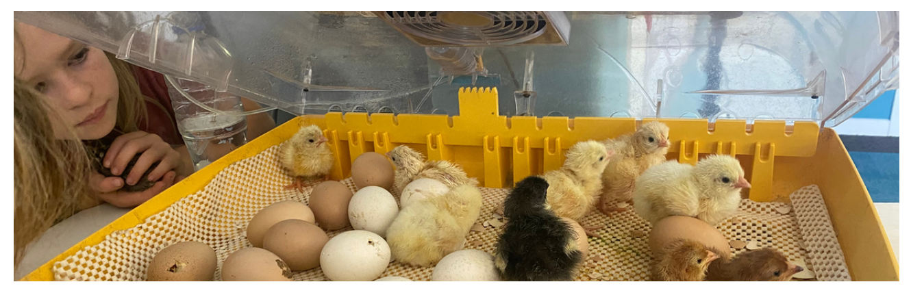
Welcoming more new members to our Ngunguru School - the chicks!